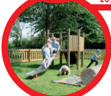
207 Large Infant Tower - Basic