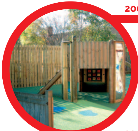
206 Large Infant Tower