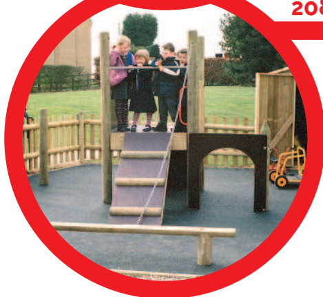
208 Camblesforth Tower